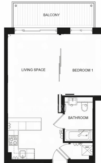
00204-5AM.BP.NW9 - 2nd floor

Living Space 3.10m x 7.58m 10' 2" x 24' 10" Bedroom 1 2.50m x 3.72m 8' 2" x 12' 3"