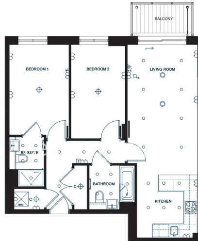
00618-37CH.BP.NW9 - 3rd floor