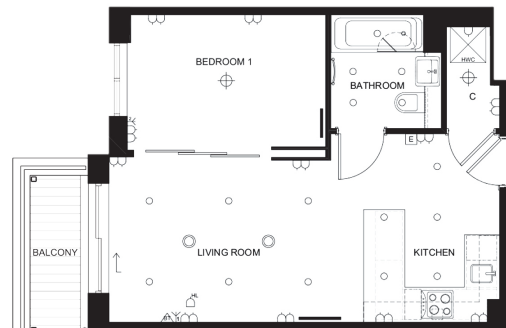
00732 - 8CH.BP.NW9 - 1st floor

Living Space 7.21m x 3.05m 23' 8" x 10' 0" Bedroom 1 3.66m x 2.50m 12' 0" x 8' 2"