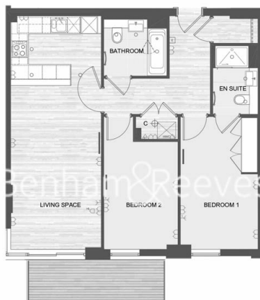
NW9 - 1st floor