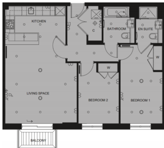
Elite Apartment 2009