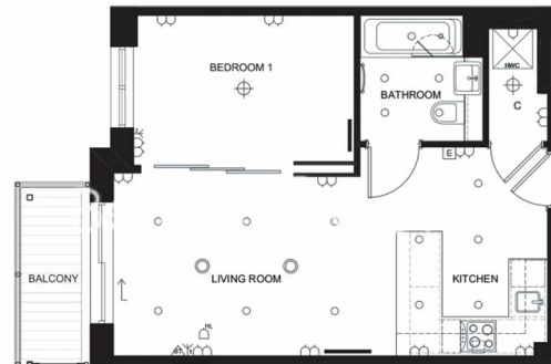
00620-20CH.BP.NW9 - 2nd floor

Living Space 7.21m x 3.05m 23' 8" x 10' 0" Bedroom 1 3.66m x 2.50m 12' 0" x 8' 2"