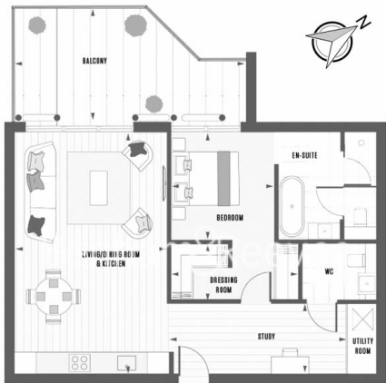
4th Floor Approx gross internal area: 735sq/ft - 68.3q/m