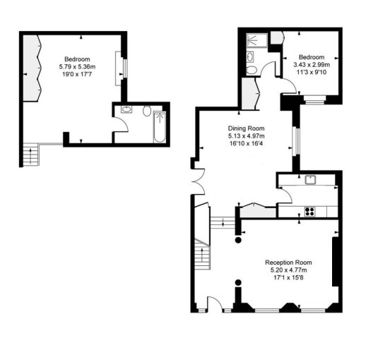
Ground Floor Approx gross internal area: I400sq/ft - I30sq/m

Whilst every attempt has been made to ensure the accuracy of the floor plan contained here, measurement of doors, windows, rooms and any other items are approximate and no responsibility is taken for any entro, comession, or mastetaement. This plan is for flustative purposes only and should be used as such by any prospective purchaser. The sentices, systems and appliances shown have not been tested and no guarante as to their operability or efficiency can be given.