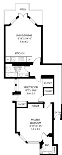
Lower Ground Floor Total Gross Internal Area 92 Sq/m - 994 Sq/ft

Floor Plan measurements are approximate and are for illustrative purposes only. While we do not doubt the floor plans accuracy, we make no guarantee, warranty or representation as to the accuracy and completeness of the floor plan.