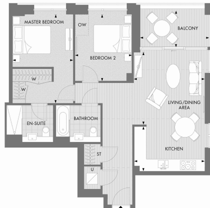
8th Floor Approx gross internal area: 860sq/ft - 80sq/m