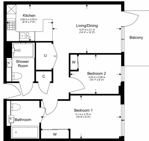
8th Floor Total Gross Internal Area 62.2 Sq/m - 670.2 Sq/ft