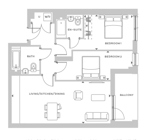
3rd Floor Approx gross internal area: 755sq/ft - 70sq/m