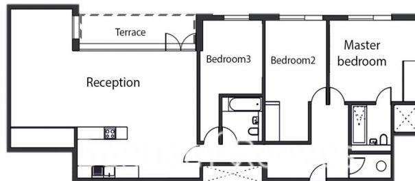
00227-40TR.NW6 - Ground floor